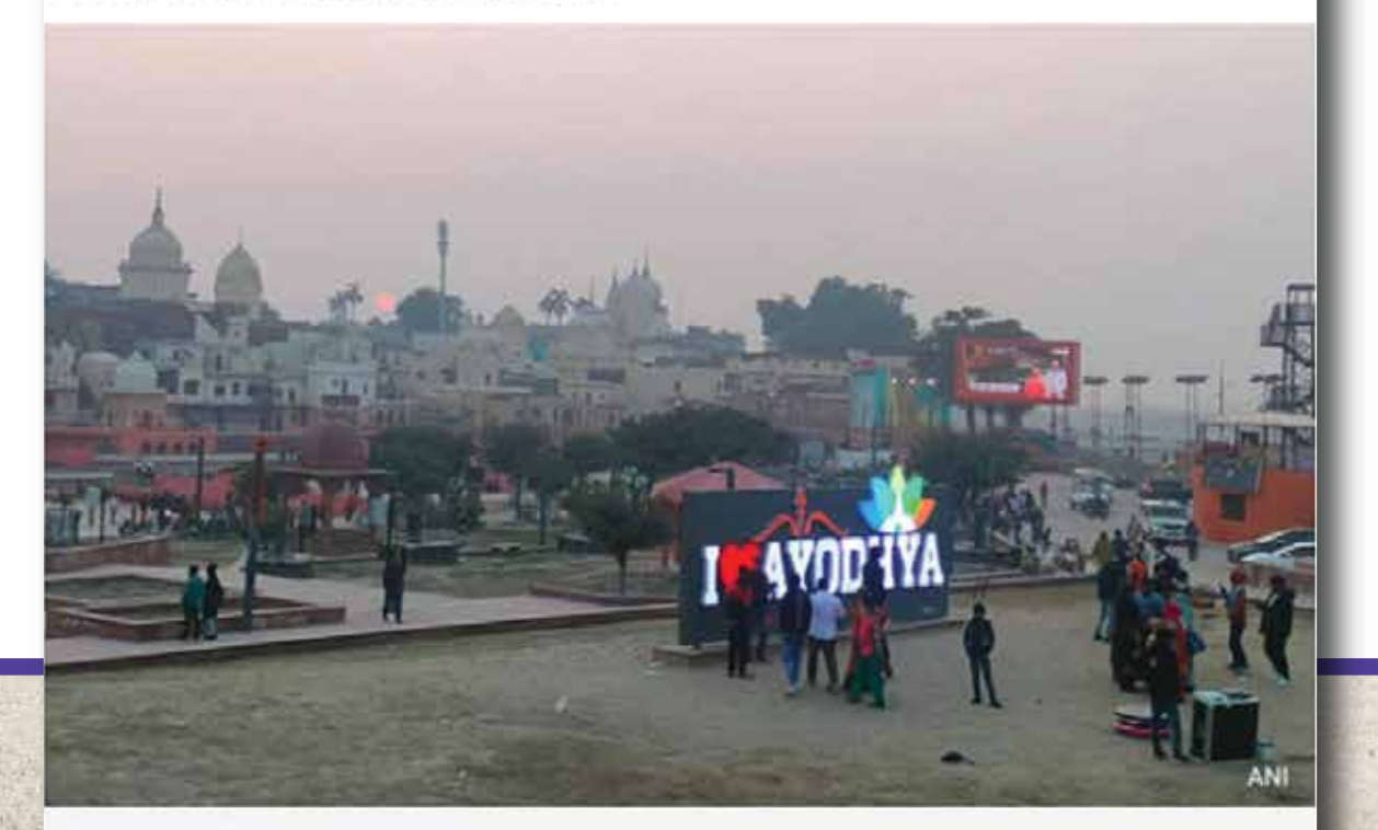
The "Spiritual Forest" will come up on the banks of Sarayu river.

India News | Press Trust of India | Updated: January 11, 2024 4:45 pm IST