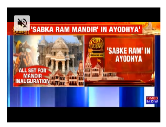
Ayodhya Ram Mandir: Glimpses of preparations ahead of the much-awaited inauguration on Jan

Ayodhya Ram temple: 70% of the expansive 70-acre complex will be designated as green spaces. It will also have two sewage treatment plants (STPs), a water treatment plant (WTP), and a dedicated power supply line. To accommodate visitors, especially the elderly and those with special needs, the complex will feature a lift and two ramps at the entrance.