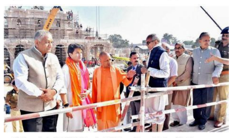
Taking stock: Chief Minister Yogi Adityanath, and Union Ministers Jyotiraditya Scindia and V.K. Singh inspect the construction of the Ram Temple ahead of its inauguration, in Ayodhya on Saturday. | Photo