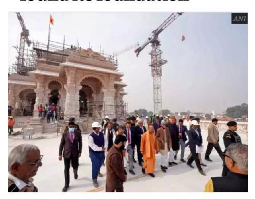
Construction work at Ayodhya