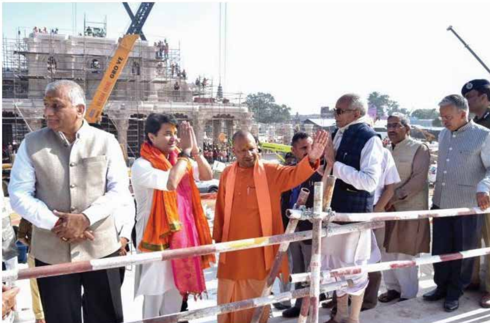
IMAGE: Union Civil Aviation Minister Jyotiraditya Scindia (second from left) with UP Chief Minister Yogi Adityanath (second from right) and Union Minister of State for Road Transport and Highways General (Retd) VK Singh (left) visit Ram Mandir construction site, in Ayodhya, December 2, 2023.

T he Ram temple trust has invited 7,000 people including cricket legends Sachin Tendulkar and Virat Kohli, Bollywood superstar Amitabh Bachchan, and billionaire industrialists Mukesh Ambani and Gautam Adani to the consecration ceremony at the Ram temple, sources said on Wednesday.