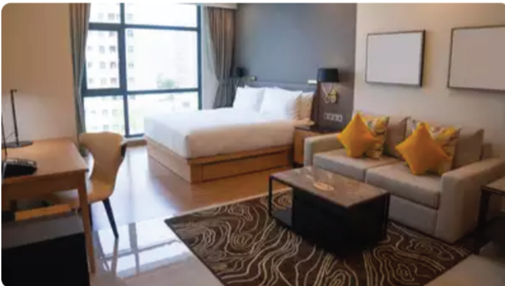
The Uttar Pradesh Housing and Development Board has recently invited interested parties to participate in an e-auction of hotel plots in Ayodhya.

As the inauguration of the Ram Mandir in Ayodhya approaches, hotel chains and investors are eyeing the city for potential growth. The development of infrastructure in Ayodhya is expected to benefit the hospitality and travel services sector. ...Read More