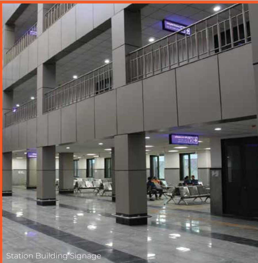
Station Building Signage

Redevelopment of Ayodhya Railway Station